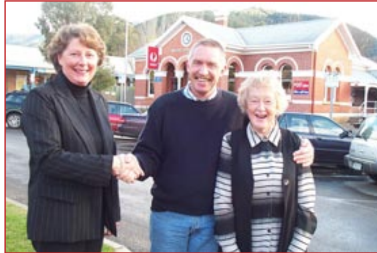
The Foundation appreciates the support of service clubs in helping to raise funds and organise donations.

The Foundation is able to provide urgent welfare support in times of need and can hold funds in trust for specific bequests.